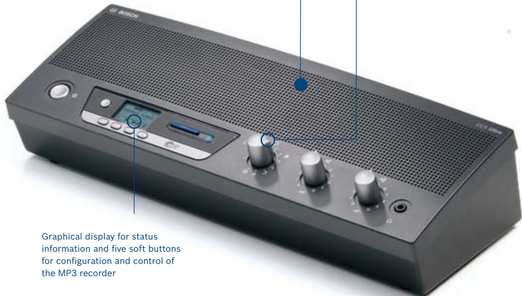
Graphical display for status information and five soft buttons for configuration and control of the MP3 recorder

Intuitive microphone mode switch which makes the CCS 900 Ultra System easy to use without an operator. Up to four microphones can be made active simultaneously.