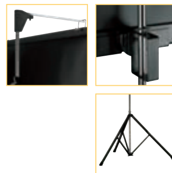
▲ Professional projection screen on tripod with keystone eliminator.